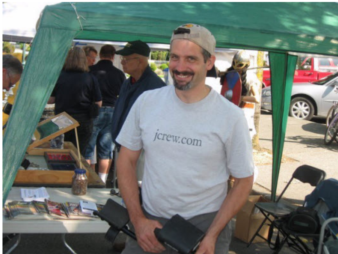
Enjoying sharing a bit of info about Metal detecting