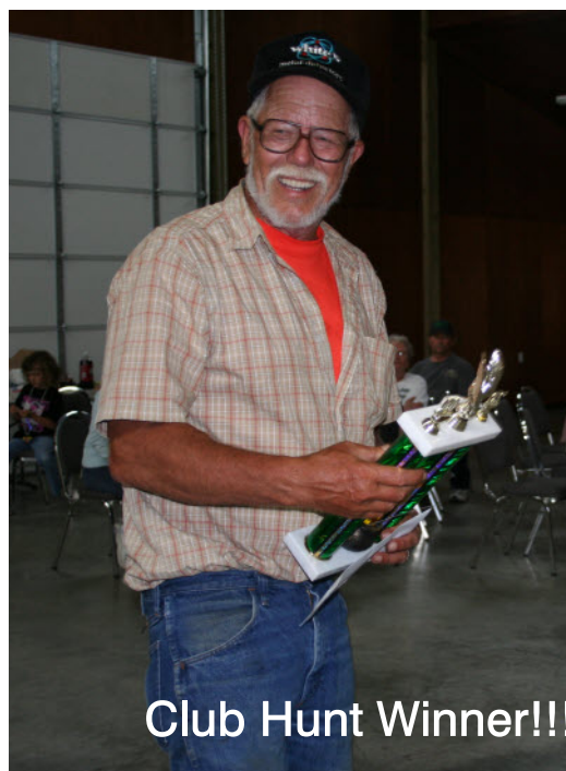
Club Hunt Winner!!!