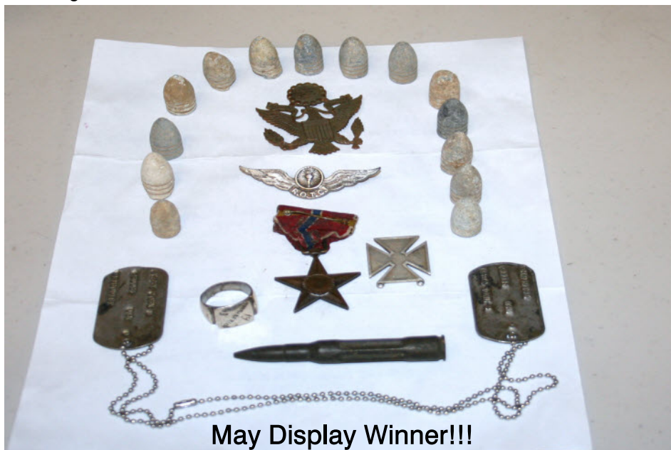
May Display Winner!!!