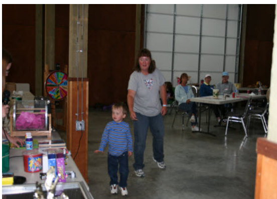
Our youngest hunter at Junefest 2009

Published by the Pilchuck Treasure Hunting Club. Founded 1982