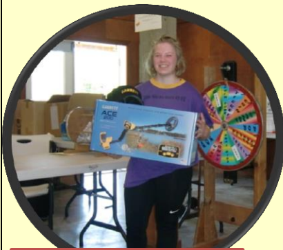
Garrett Ace 200