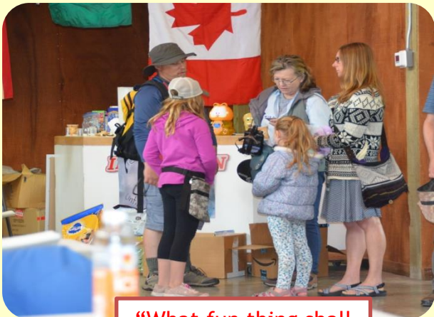
"What fun thing shall we do next guys!"