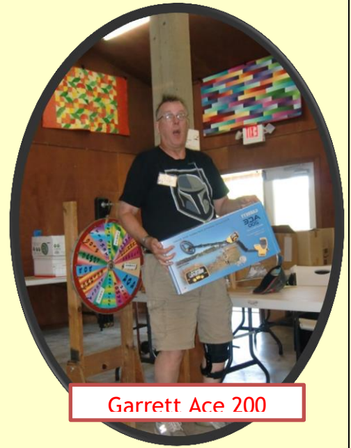
Garrett Ace 200