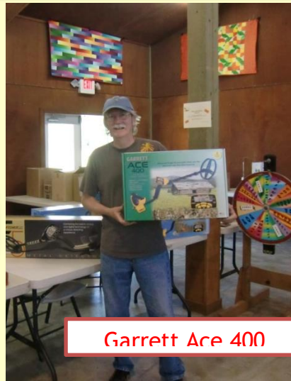
Garrett Ace 400