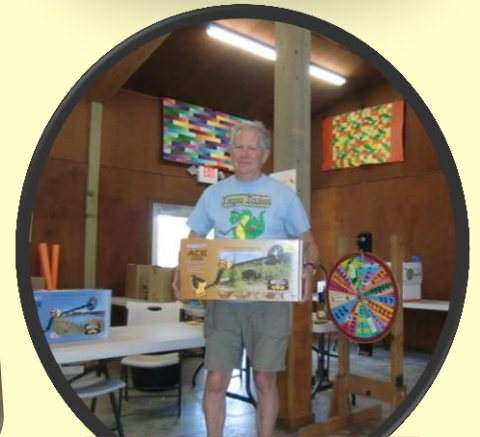
Garrett Ace 300