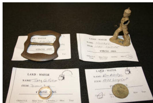
Judges favorite 4 finds for November