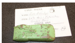
The Dirty Digger