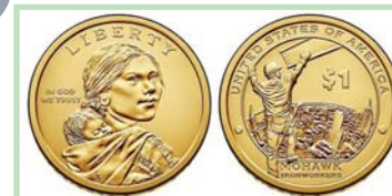
2015 Native American Dollar